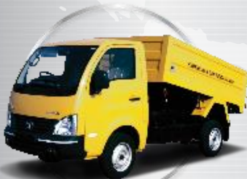
superACE GARBAGE TIPPER