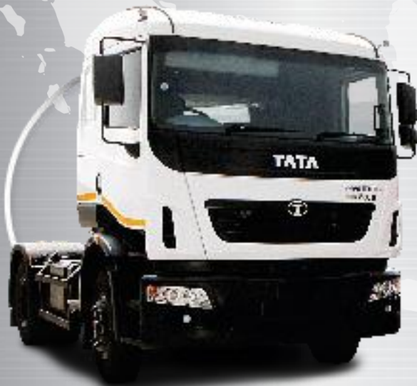
6 x 4 4928.S