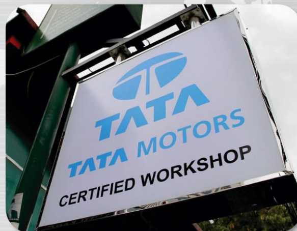
TATA CERTIFIED WORKSHOP