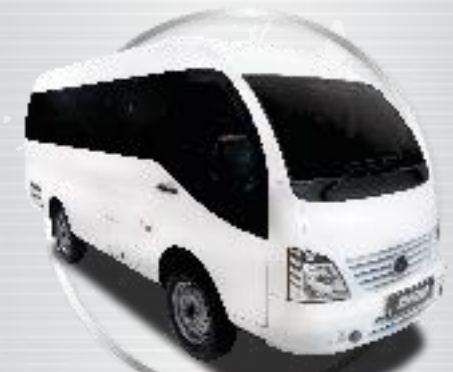
superACE LUXURY VAN