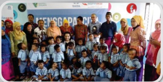
School renovation project hand over @ Sumbawa, 13 th December 2014