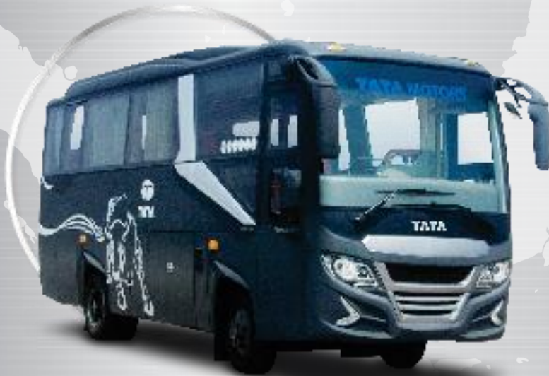
LP 713 - Luxury Bus