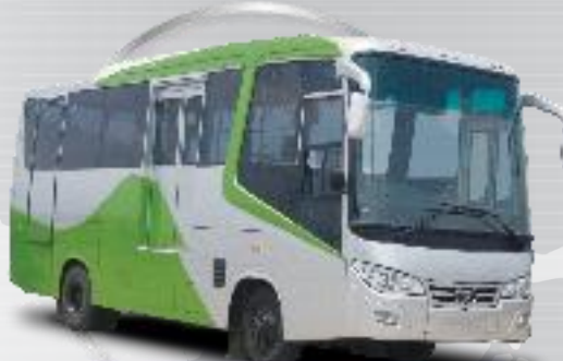
LP 713 - Intra City Bus