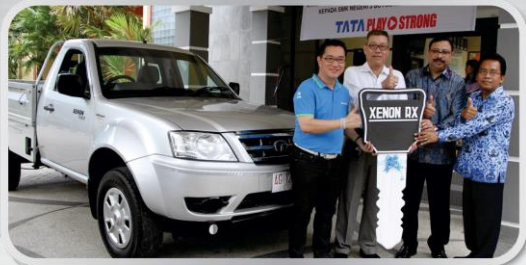
Handover of pick up vehicle TATA Xenon RX Diesel to SMK 3 Boyolangu, Tulungagung, Jawa Timur, Thursday, 17 th March 2016.