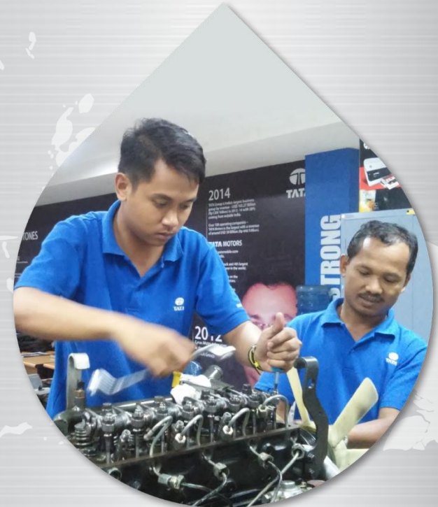
WELL EQUIPPED TRAINING CENTER