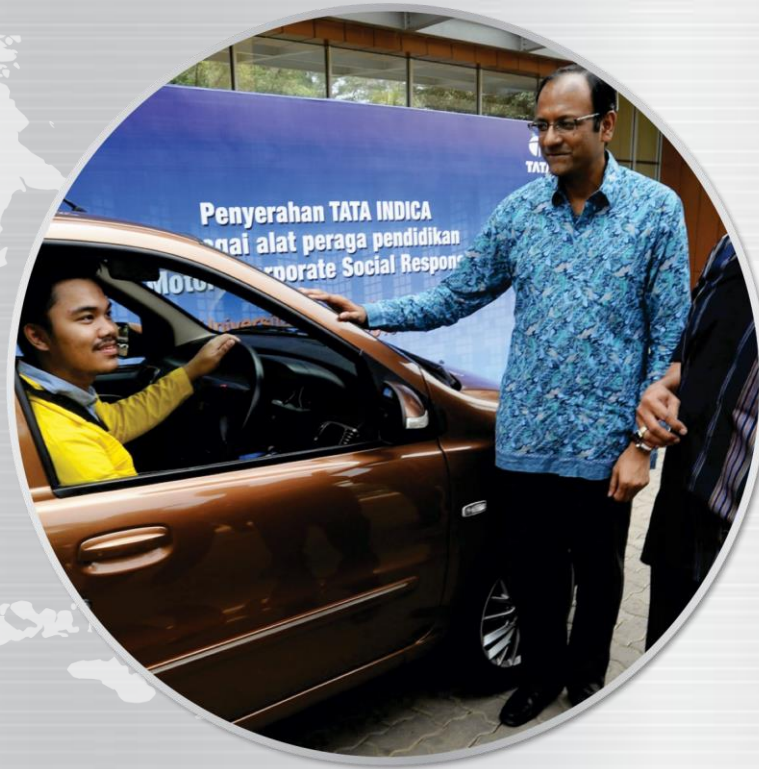
Handover of TATA Indigo vehicle to Faculty of Machine Technique at Indonesia University on October 2015.