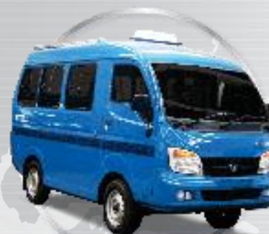
ACE EX 2 ANGKOT