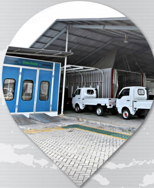
STATE OF THE ART PDI CENTER Pre Delivery Inspection