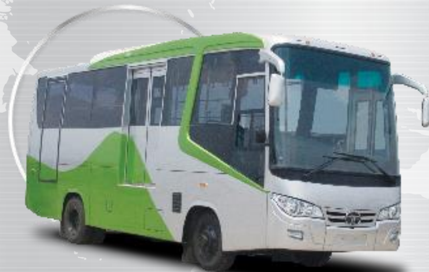
LP 713 - Intra City Bus