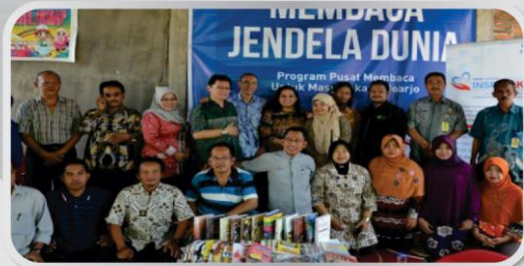
Mobile Community Library project hand over @ Sidoarjo, 22 nd October 2014