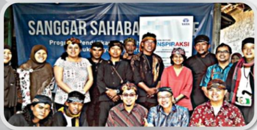
Digital Training Centre project hand over @ Karawang, 26 th September 2014