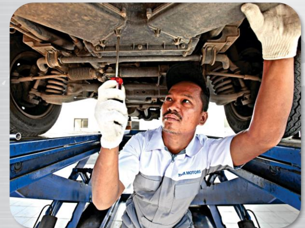
TRAINED MAN POWER