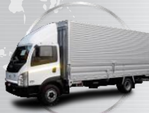
Ultra 1012 45 WB Aluminum wing Box