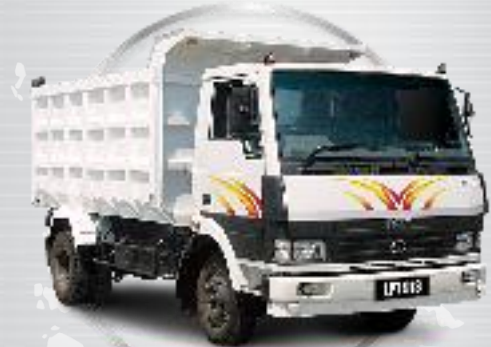
LPT 913 - Tipper