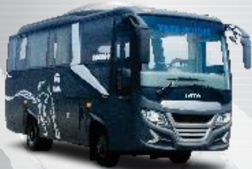
LP 713 - Luxury Bus