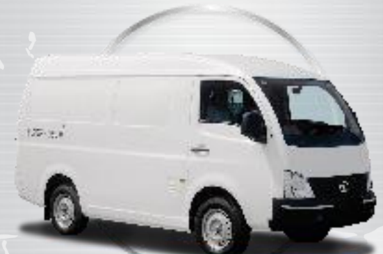
superACE BLIND VAN