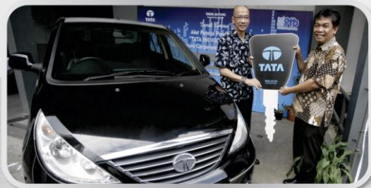
Handover of TATA Indigo vehicle to Faculty of Machine Technique at Institut Teknologi Bandung on November 2015.