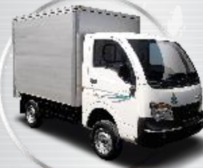
ACE EX 2 BOX