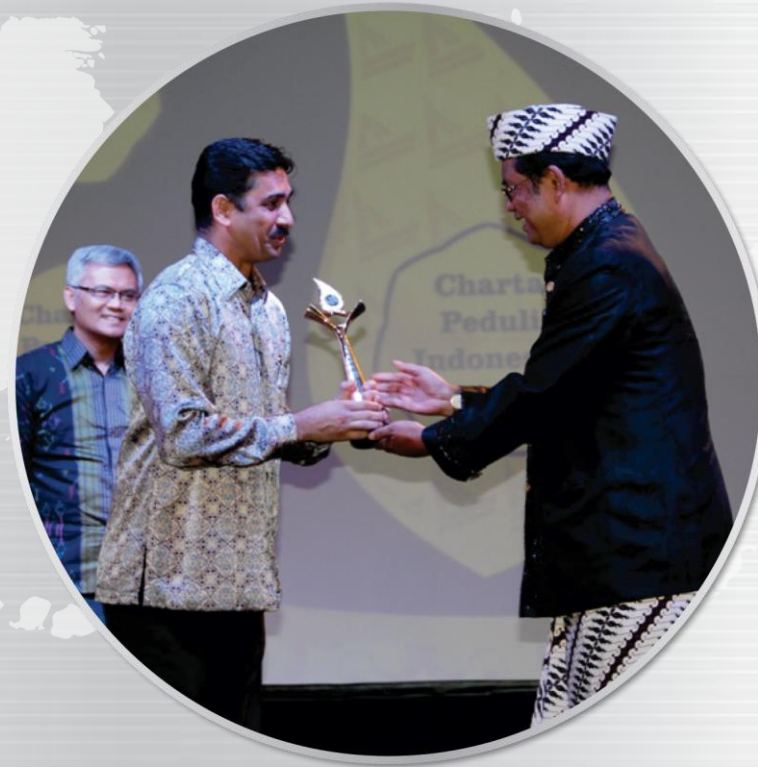
Inspiraksi received Charta Peduli 2014 in the informal Education development category