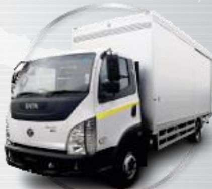
Ultra 1012 45 WB Aluminum box