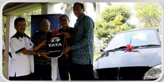
Handover of TATA Indigo vehicle to trainee of BBPLK Cevest that was held at Bekasi, Thursday, 12 th May 2016.