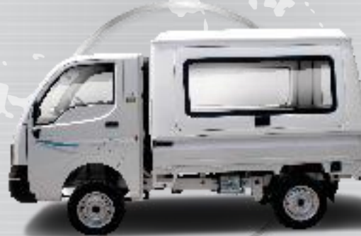
ACE EX 2 MOKO